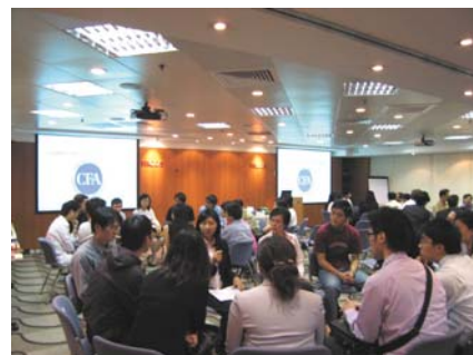
Information Session on CFA Programme

For the scholarship programme, we further increased the total number of scholarships given this year to 20 from 10 last year in consideration of the growth rate and we received a total of 102 applications for the scholarships this year. The eligibility criteria were based on (1) school grades (2) financial needs and (3) the candidate's reason for entering the CFA Programme. The scholarship given was a reduction of enrollment fees into the CFA Programme. The Board was happy to grant the scholarships on behalf of CFA Institute to the 20 most eligible candidates residing in Hong Kong and China who sought financial assistance in the pursuit of their CFA designation.