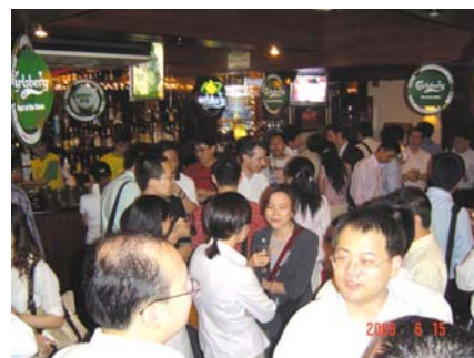
Member Gathering in Shanghai

With the strong growing members in China, we will organise more events for our members there. We will also try to identify and search for more members located in mainland China to assist our Committee there. Meanwhile, we believe that it is in the best interest of the members in mainland China to have their own local societies. We are working closely with CFA Institute to evaluate such possibility.